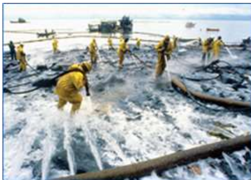
Made by the same team of Scientists that cleaned The Exxon Valdez Oil Spill.

BOSS + Drain Care is more powerful than any other product on the market and safe for humans, plumbing, plants, animals & the environment. Easy to use, just pour into toilets & drains and let it do it's work!